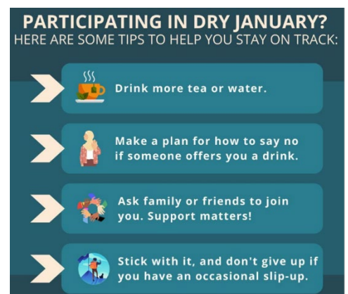
From NIAAA social media posts