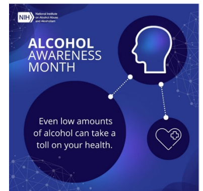
From NIAAA social media posts